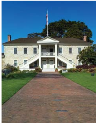
45 - ft19- colton- cg.jpg