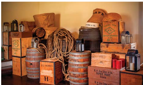
06 - ft19-custom-drt.jpg