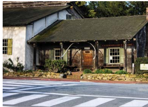
42 - ft19-theater-cmp.jpg