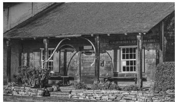
46 - ft19-theater-cg.jpg