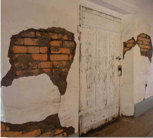
3rd Place - ft19-brick-dl.jpg