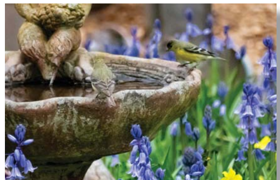
16 - ft19-soberanes-as.jpg