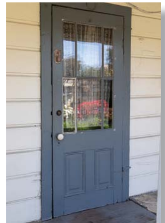
14 - ft19-soberanes-dl.jpg