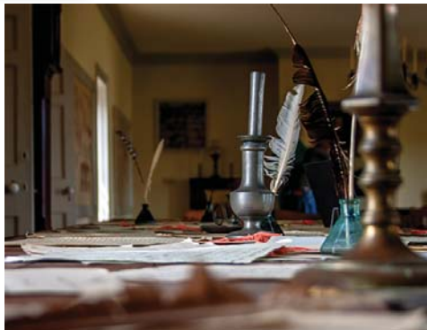
50 - ft19- colton-drt. jpg