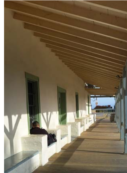
02 - ft19-custom- cg.jpg