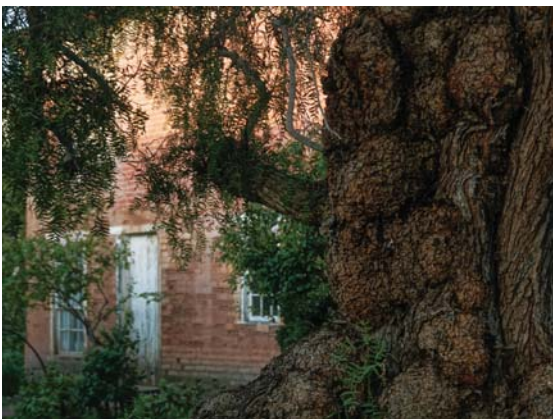
First Place - ft19-brick-cjc.jpg

Beauty and strength. I like the use of the tree for framing and the texture of the building. It would have worked better for me if the contrast was a little stronger.