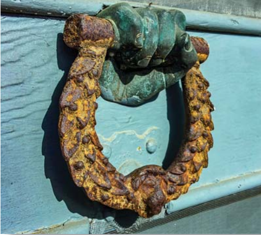
10 - ft19-soberanes-cg .jpg