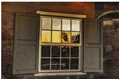
45 - ft19-theater-jw.jpg