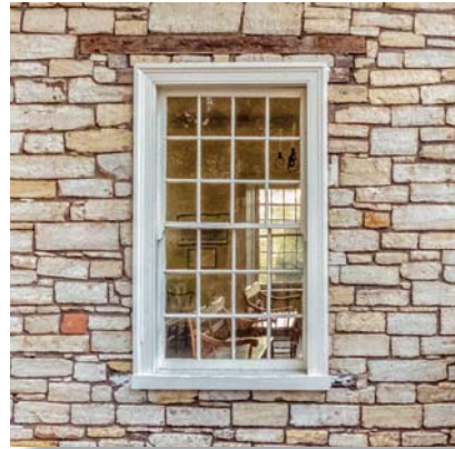
46 - ft19- colton- as.jpg