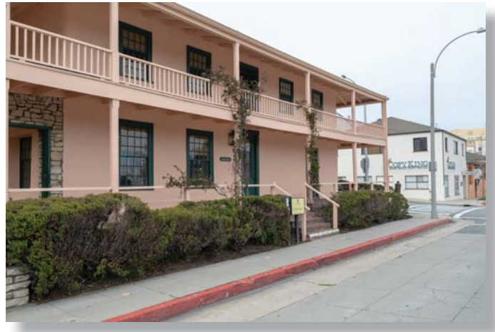
32 - ft19-larkin-dl.jpg