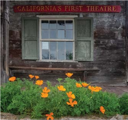
39 - ft19-theater-as.jpg