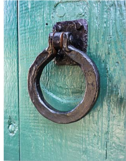
29 - ft19-larkin-cg.jpg