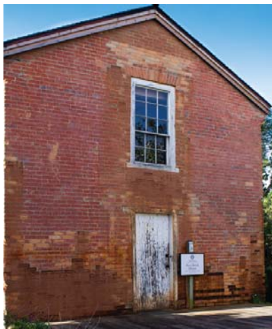
40- ft19- brick- cmp.jpg