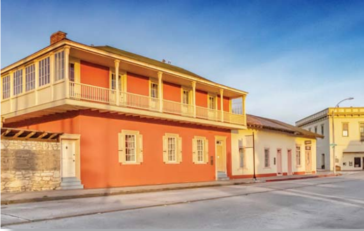
49 - ft19-adobe-as.jpg