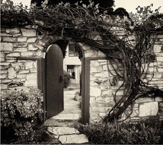
30 - ft19-larkin-as.jpg