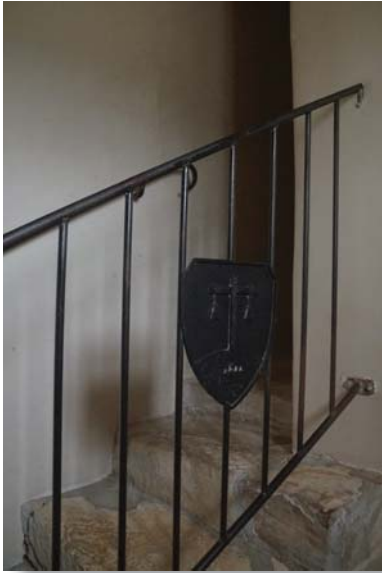
20 - ft19-chapel-cjc.jpg