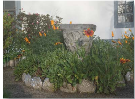
11 - ft19-soberanes-cjc.jpg