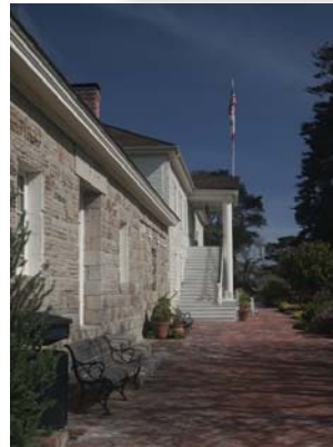
47- ft19- colton-cjc. jpg