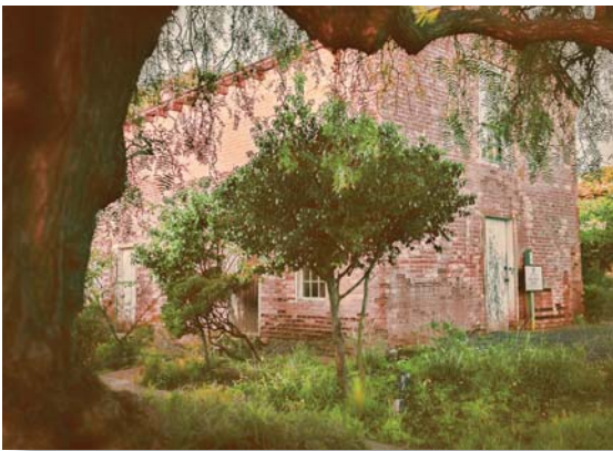
2nd Place - ft19-brick-jw.jpg

Beauty and strength. I like the composition and the color control.