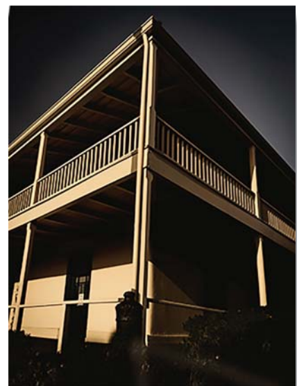
34 - ft19-larkin-jw.jpg