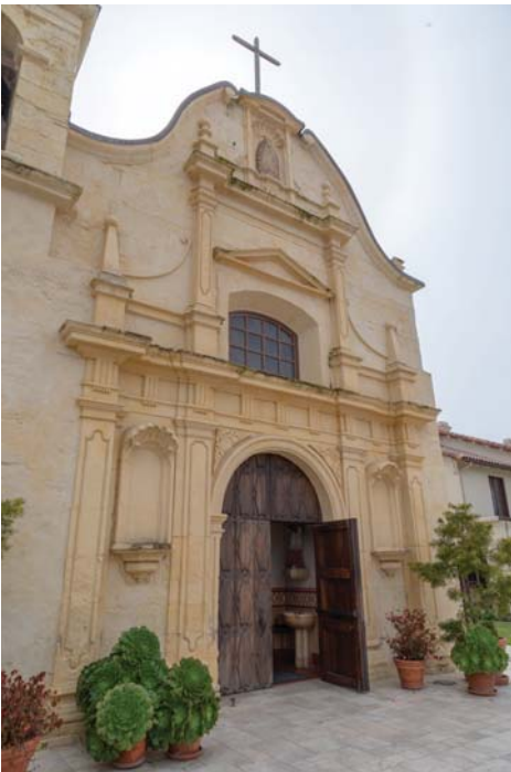
22 - ft19-chapel-dl.jpg