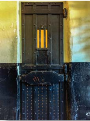
44- ft19- jail-cg. jpg