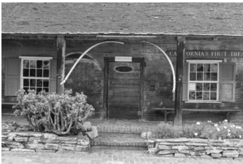
43 - ft19-theater-dl.jpg