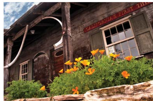
44 - ft19-theater-drt.jpg