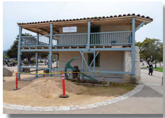
05 - ft19-custom-dl.JPG