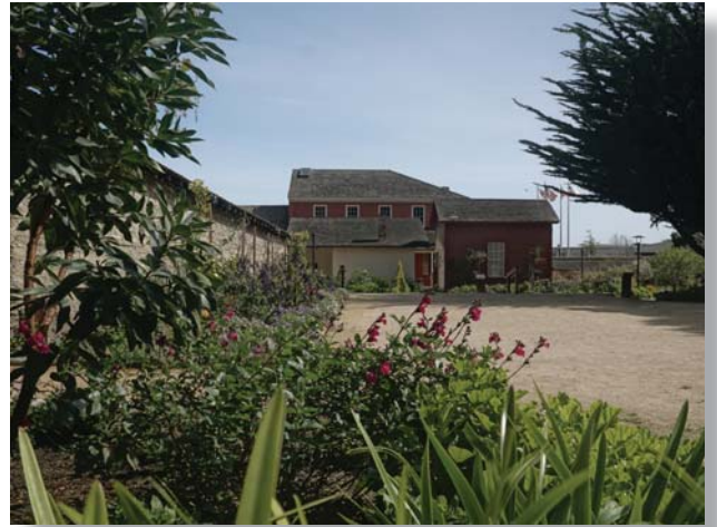
50 - ft19-adobe-cjc.jpg