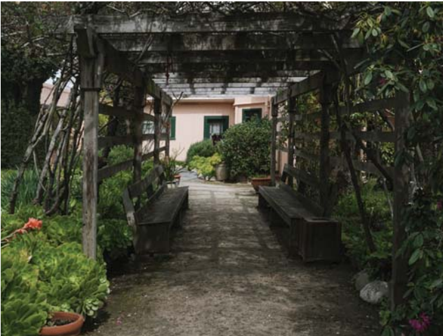
31 - ft19-larkin-cjc.jpg