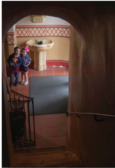
19 - ft19-chapel-as.jpg