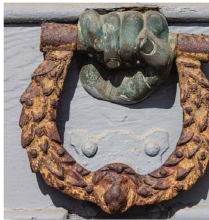
13 - ft19-soberanes-cmp.jpg