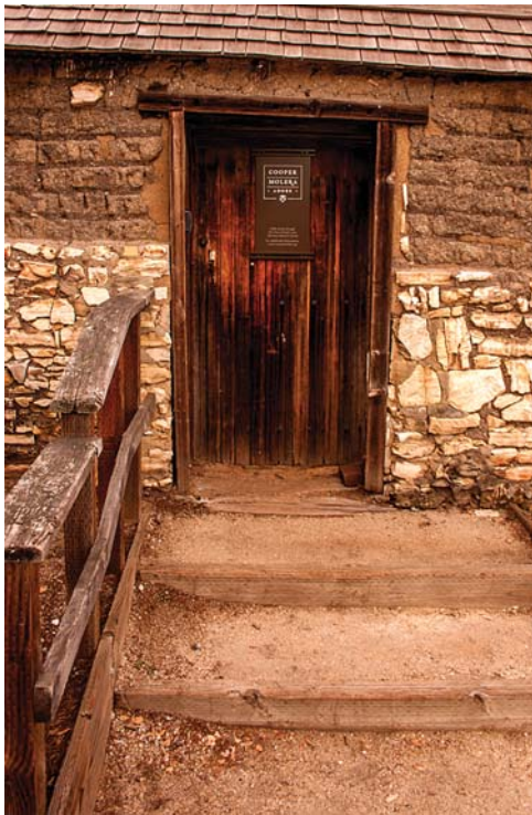
51 - ft19-adobe-drt.jpg