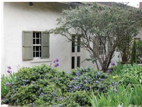
41 - ft19-theater-cl.jpg