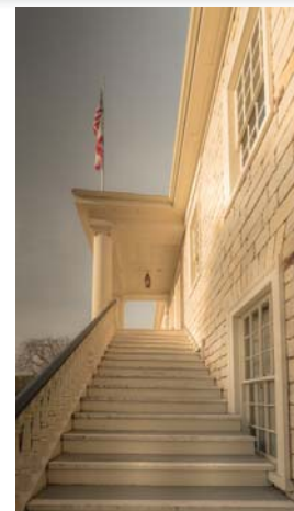
51 - ft19- colton- jw.jpg