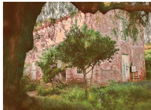
43- ft19- brick-jw. jpg