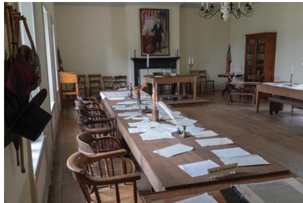
49 - ft19- colton- dl.jpg