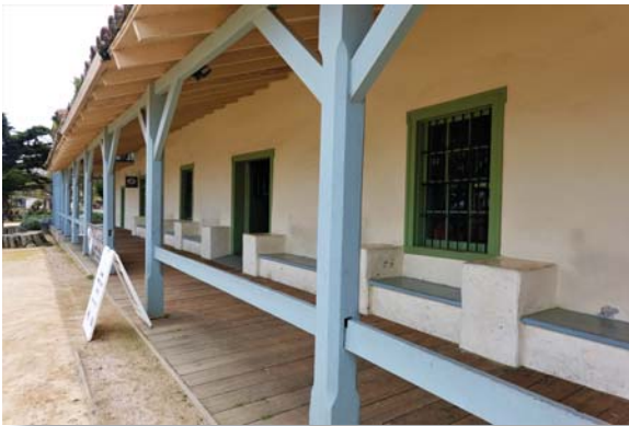
04 - ft19-custom-cl.jpg