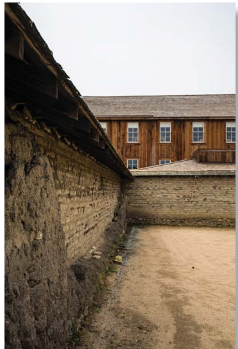
52 - ft19-adobe-jw.jpg