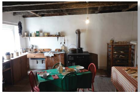
39- ft19- brick-cl. jpg