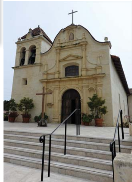
21 - ft19-chapel-cl.jpg