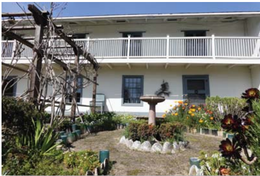
12 - ft19-soberanes-cl.JPG