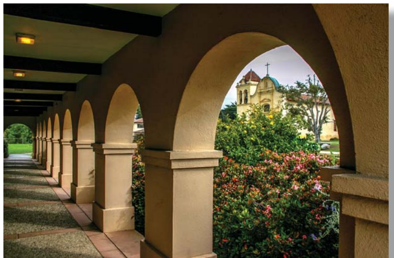
23 - ft19-chapel-drt.JPG