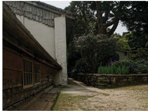
40 - ft19-theater-cjc.jpg