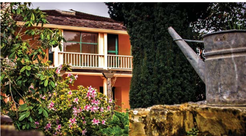
33 - ft19-larkin-drt.jpg