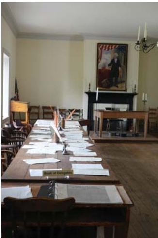
48 - ft19- colton-cl. jpg