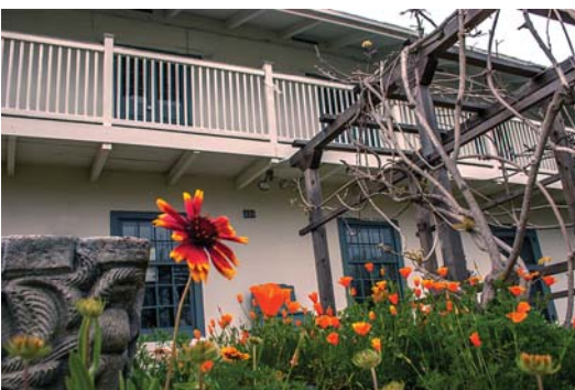
15 - ft19-soberanes-drt.jpg